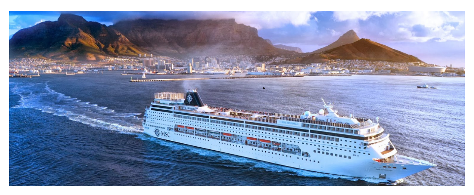
Book Your MSC Yacht Club before the End of May and Benefit from the Large List of Benefits Among Other Up To 15% Discount on the 2<sup>nd</sup> Person!