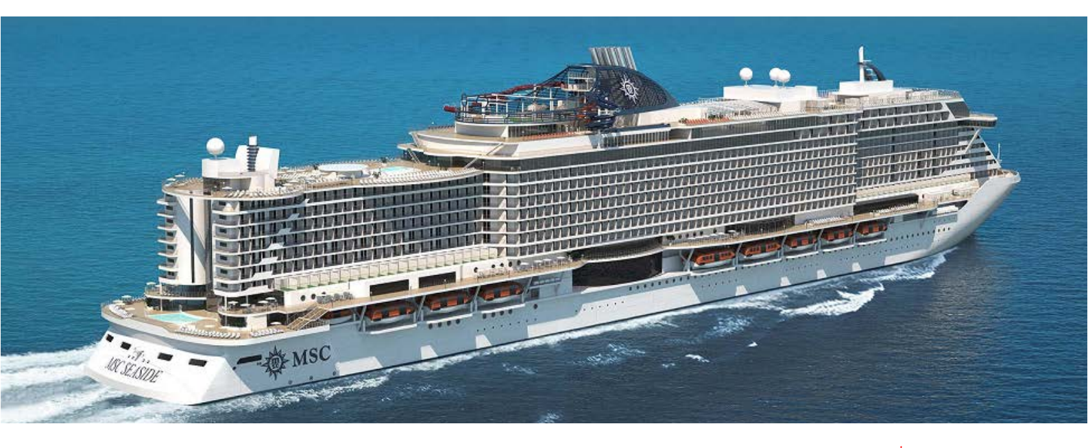
Book your Summer 2018 Cruise Package before the end of March and benefit from up to 30% OFF the 2<sup>nd</sup> Pax!