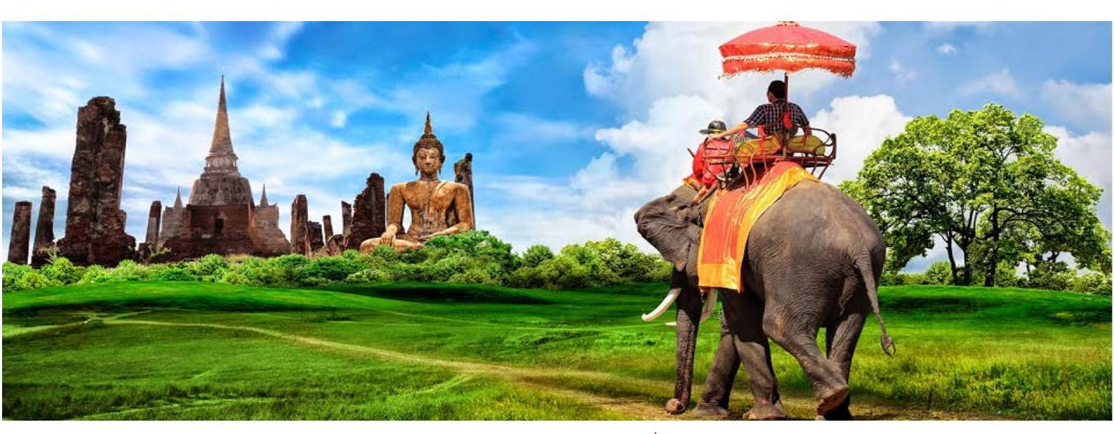
Book your Easter Package before the 10th of February & benefit from 25% OFF on the 2<sup>nd</sup> passenger!