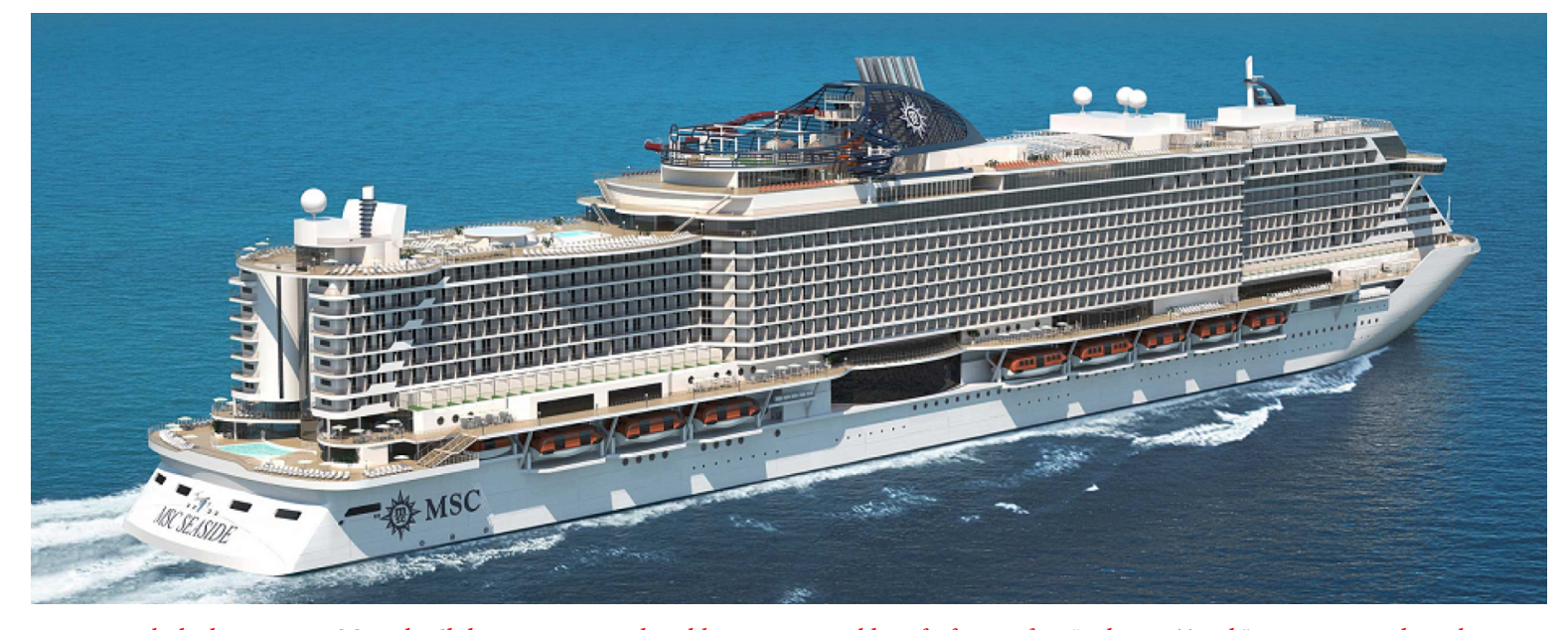
Book the luxurious MSC Yacht Club Experience with Wild Discovery and benefit from a free "Relaxing Touch" treatment on board!