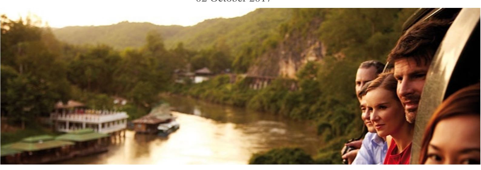
Book your journey before the 25<sup>th</sup> of August and your companion will get a 50% discount!

The Eastern and Oriental Express Fables of the Peninsula 6 Nights 02 October 2017