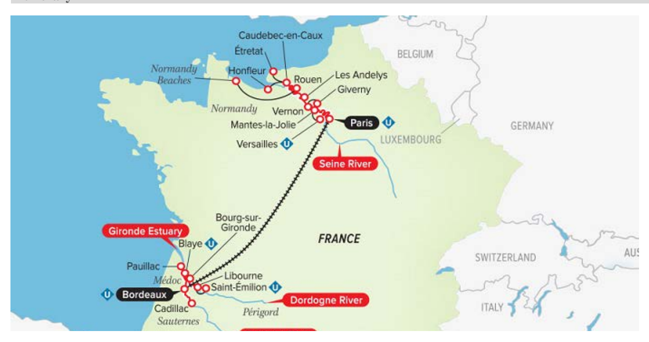
Day 1: Paris

Arrive at Paris Charles de Gaulle Airport, where you will be transferred to the ship.