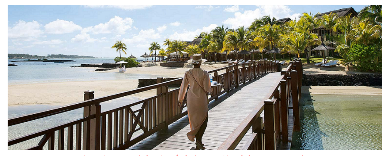
Book your honeymoon before the 15th of February and benefit from an exceptional rate!