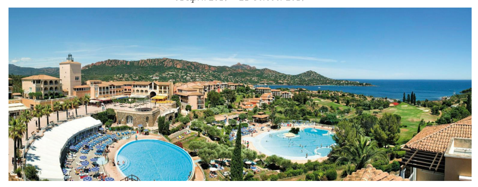
Book before March 30th and benefit from up to 20% discount!