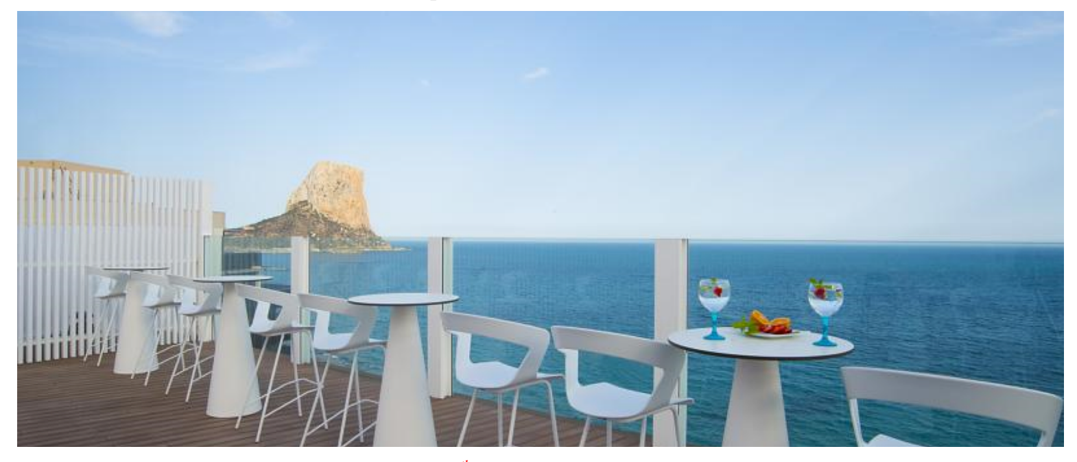
Book before March 30th and benefit from up to 20% discount!

Calpe Bahia Calpe 4* 7 Nights 01 April 2017 – 21 October 2017