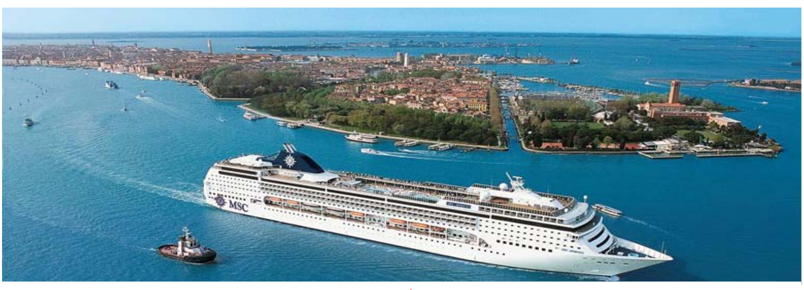
Book your summer MSC Cruise before the 23<sup>rd</sup> of May and benefit from exceptional rates!