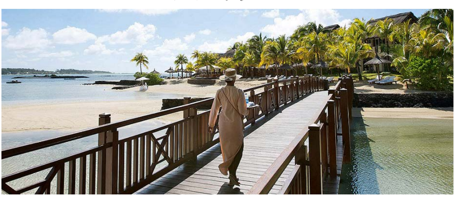
Book your honeymoon at Shangri La Le Touerrsork Resort & Spa 5* and benefit from a special rate!