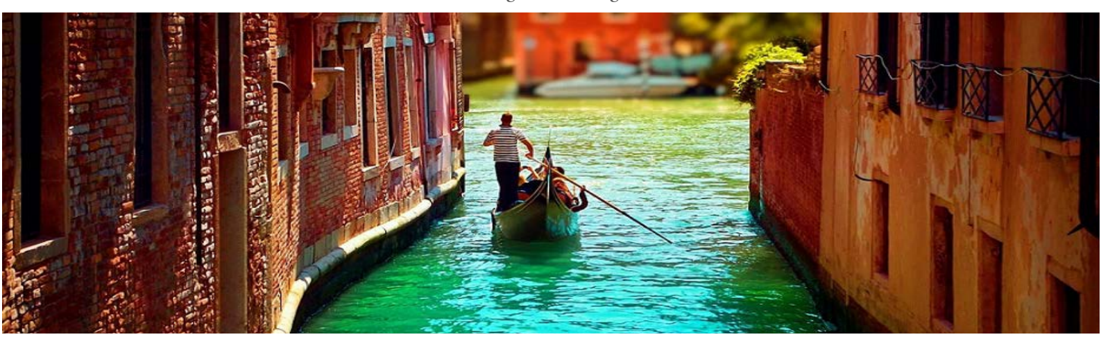
Book before the 6<sup>th</sup> of July and get a 125$ discount per person!

7 Nights From 17 July to 24 July 2015 From 22 August to 29 August 2015