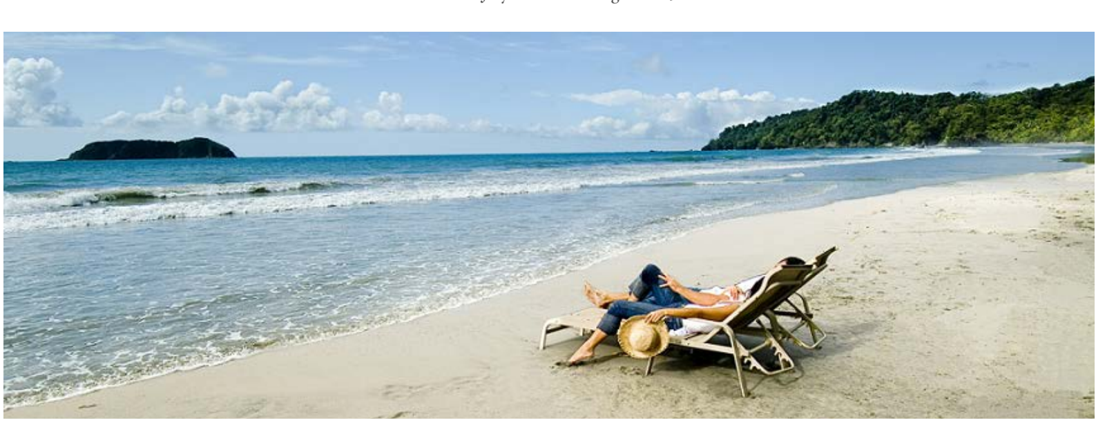
Book before the 30<sup>th</sup> of May and get a 75$ discount per person!

Direct Flights with Aegean Airlines from Tuesday till Friday on: 21 till 24 July & 18 till 21 August 2015