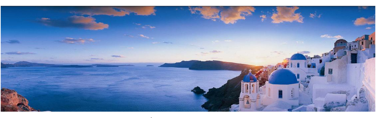
Book before the 30<sup>th</sup> of May and get a 75$ discount per person!

1st Direct flight with Middle East Airlinesstarting July 14 till September01, 2015 From Tuesday till Tuesday